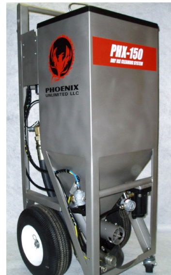
PHX-150 Dry Ice Cleaning System Versatile, extremely aggressive Stainless steel / 100% pneumatic

CO 2 OL BLAST — — — — — Equipment Company, Inc