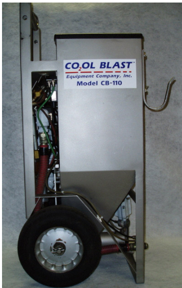
CB-110 Dry Ice Cleaning System Economical, powerful, easy to use Stainless steel / 100% pneumatic

COOL BLAST EQUIPMENT COMPANY is the leader in providing CO 2 blast cleaning technology to industry in the Southeastern United States. We offer sales of new, used, and factory refurbished blasters, as well as short term & long term rentals, parts, service, consulting & contractor referral services, and dry ice. Contact us today and ask about our no cost / no obligation site survey & product demonstration .